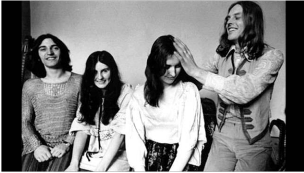
[The Incredible String Band]

And, to close the circle, here are the Incredible String Band themselves in 1967. Still a duo, but about to become a quartet, the String Band were inveterate probers who would happily combine early, oriental, modern, folk, and electrified instruments in a single song. Dolly Collins guests on this track, playing the flute organ. 2 And of course there's a harpsichord. What was extraordinary about this band was its complete refusal to espouse any generic style beyond a highly idiosyncratic mixture of scholarship, eccentricity, eclecticism and a love of bricolage. The harpsichord here is the least of it: everything on this track is eloquent of our topic.