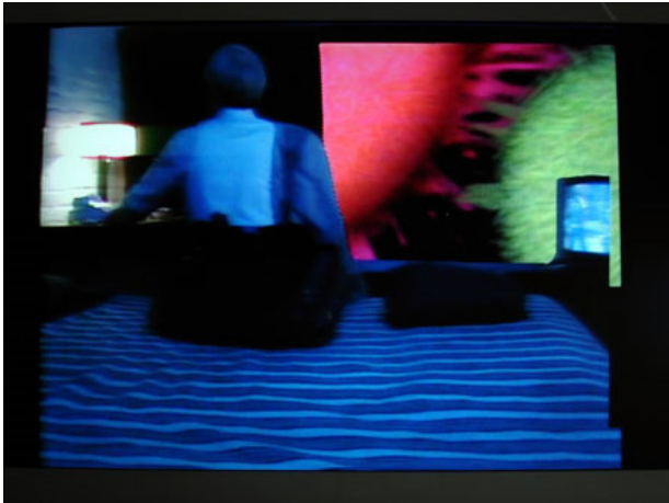
[Robert Ashley, 'Perfect Lives: An Opera for Television, The Bar (Differences)', 1984]

television broadcasts. To make this short piece, he spliced together tapes of source material and re-edited it into an audio version of a cut-up while he was living in the famous Beat Hotel in Paris. Since the idea of the cut-up is to obscure the idea of coherency, it's hard to tell which sources derive from where. In this jumbled landscape, television voices meld with radio and with the author's.