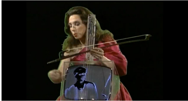
[Charlotte Moorman plays the TV Cello on Nam June Paik's television show, Good Morning Mr. Orwell , interviewed by George Pimpton and performance, 1984]