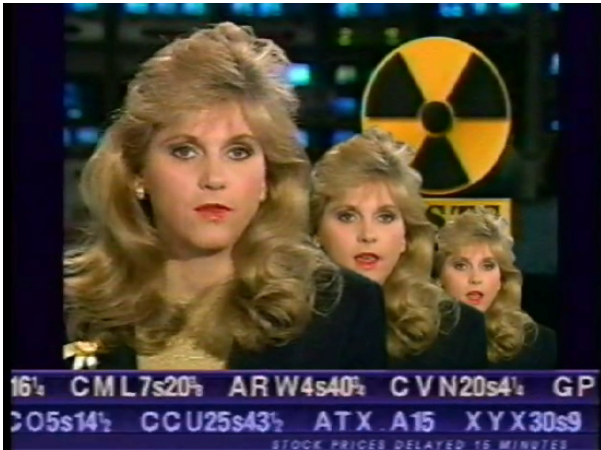
[Emergency Broadcast Network]