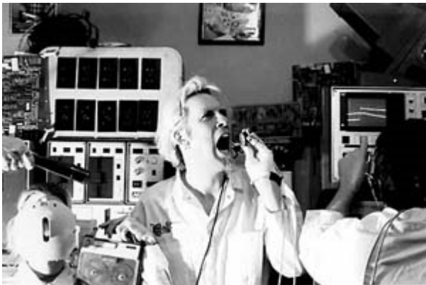
[Evolution Control Committee]

Every effort has been made to trace copyright holders; any errors or omissions are inadvertent, and will be corrected whenever it's possible upon notification in writing to the publisher.