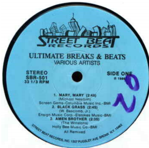
[ Ultimate Breaks and Beats, Volume One , 1986]

Stephen Feld 'A Sweet Lullaby for World Music' http://web.archive.org/web/20070830061933/http://www.deepforestmusic.com/dypress_00-00-00sweetlullabyforworld.htm