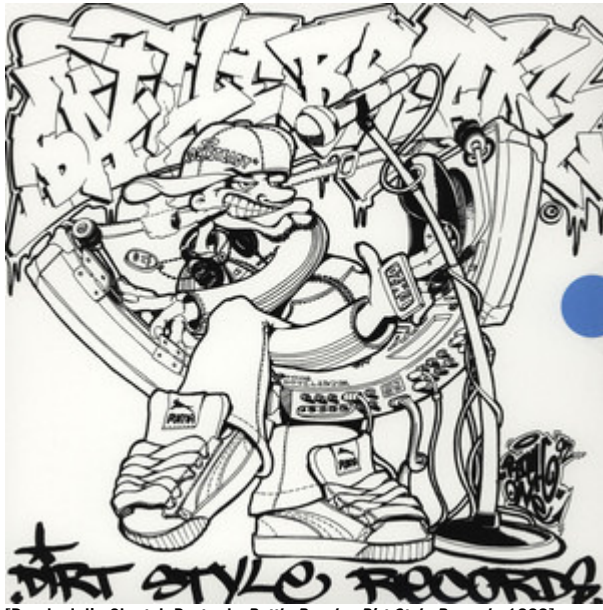
[Psychedelic Skratch Bastards Battle Breaks , Dirt Style Records , 1992]