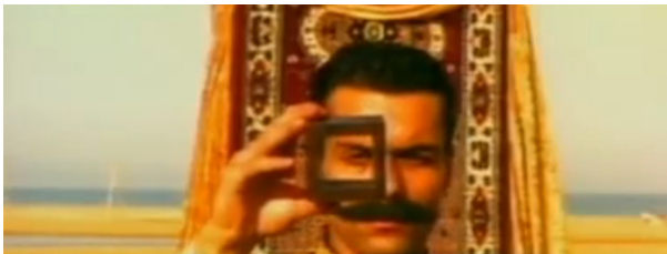
[Deep Forest video]